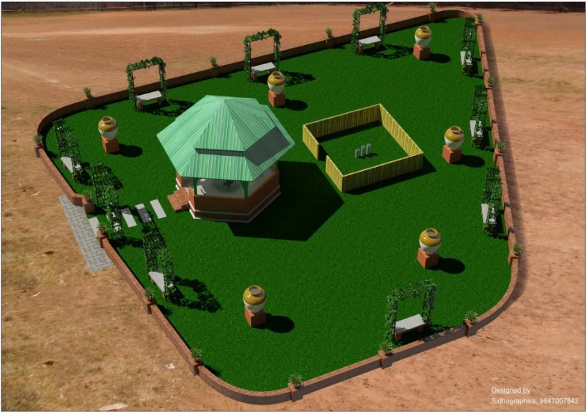
Oushadhi Demonstration Garden